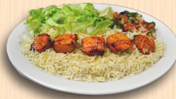
Chicken Breast Kabob $8.95