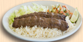
Kofta Kabob $9.95