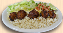
Lamb Kabob $11.95