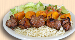
Chicken Beef Sultani $12.95