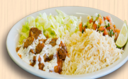
Broni Badenjan (Eggplant) $8.95