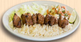
Beef Tika Kabob $9.95