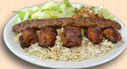
Sultani Kabob $11.95