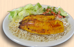
Fish Kabob $9.95