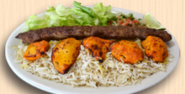
Chicken Sultani $11.95