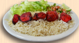
Chicken Tandory Kabob $8.95