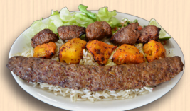
King Sultani $14.95