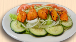
Grilled Chicken Salad $7.95